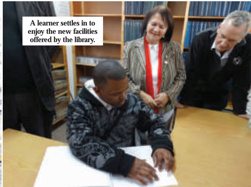
A learner settles in to enjoy the new facilities offered by the library.